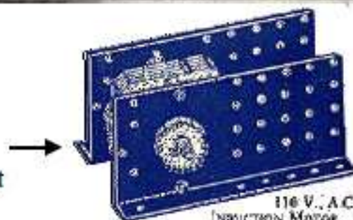
110 V. A.C. Induction Motor No. 314 $1.50 each