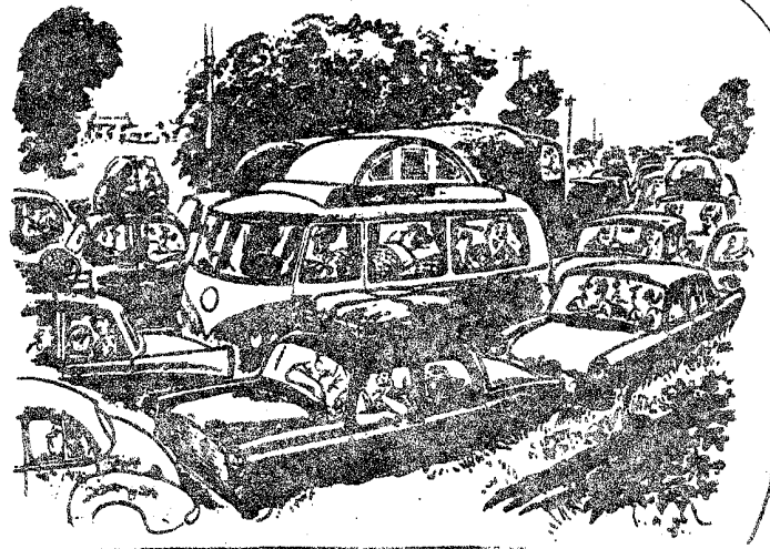
..... The road to Norton at 5 a.m., SMG Meeting Day.

21st JANUARY NORTH MIDLANDS MECCANO GUILD, Club Meeting (Oxton) 18th FEBRUARY North East London Meccano Club, Club Meeting, (Barkingside) 25th FEBRUARY Henley Society of Meccano Engineers, Club Meeting (Henley) 11th MARCH West London Meccano Society, Club Meeting (Greenford) 25th MARCH Midlands Meccano Guild, Club Meeting (Alcester) 8th APRIL SHEFFIELD MECCANO GUILD, Club Meeting (Norton) 22nd APRIL Holy Trinity Meccano Club, Club Meeting (Hildenborough) 20th MAY NORTH MIDLANDS MECCANO GUILD, Club Meeting (Oxton) 27th MAY Henley Society of Meccano Engineers, Club Meeting (Henley) 10th JUNE North East London Meccano Club, Exhibition (Barkingside) 10th JUNE West London Meccano Society, Club Meeting (Greenford) 25th JUNE LINCOLN MECCANO EXHIBITION 7th-9th JULY SKEGEX